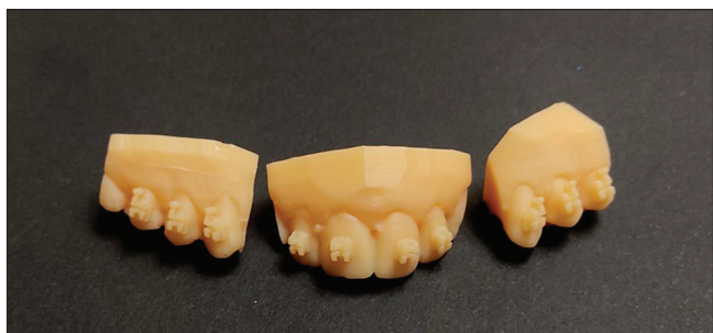
Figure 1: 3D printed model with resin brackets

Resin models with resin brackets were 3D printed from hard resin Model 2.0 resin (Nextdent, Netherlands) in segments (Figure 1). Then 1 mm soft sheet was thermoformed on the printed model to produce a vacuum formed transfer tray with negative replica of brackets places and brackets were fitted in the vacuum formed transfer trays (Figure 2).