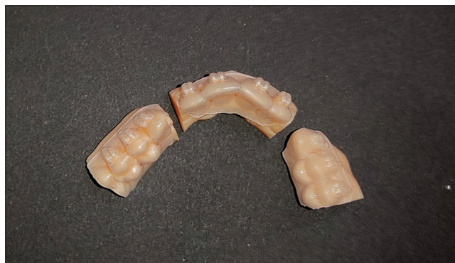
Figure 2: Vacuum formed transfer tray

All teeth were polished with brush and pumice then etched with 37% phosphoric acid for 20 s. Proper drying by air with paying attention to lingual and palatal surfaces of teeth, and isolation were done. Ortho solo