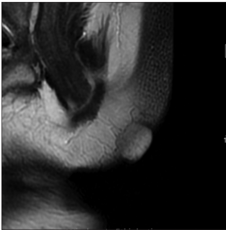
Figure 2: Magnetic resonance imaging of the perianal lesion

and connective tissue [1]. Chronic irritation is often due to associated conditions such as hemorrhoids, fissures, and fistulas accompanying the polyps (Figure 3). In our study, the rate of perianal diseases accompanying FEPs was statistically significantly higher than that of condylomas (Table 4).