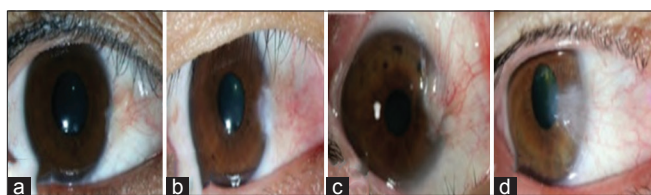
Figure 1. The grading of pterygium is based on an extension to the cornea. Grade I (a), Grade II (b), Grade III (c), and Grade IV (d) [17].

The preparation stage was carried out interviews, eye examination, and eye documentation by the researcher. Criteria for pterygium grading based on an extension to the cornea shown in Figure 1 [17].