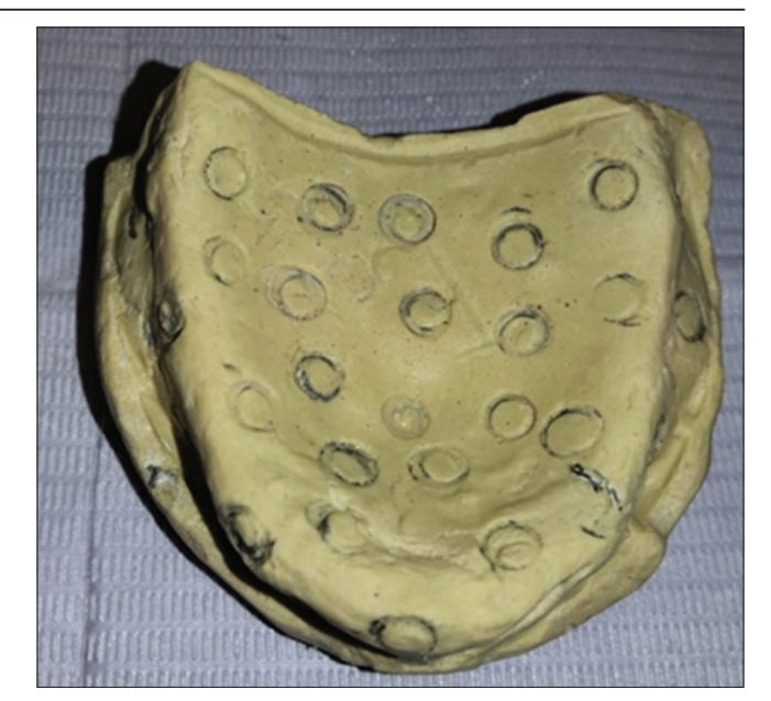
Figure 1: Denture with multi-suction cups

The device used for the measurement of denture retention was a universal test machine. To attach the metal rods of the machine to the denture, modification of the denture by drilling two holes at the canine area and fixing 3 mm metal tubes in them by self-cured acrylic resin. The patient sit with his head in upright position, then the pins of the metallic rods of the universal test machine were fixed to the metal tubes of the denture, and the machine applies a downward force until the denture was detached, the amount of dislodged force was recorded in Newtons at insertion, 15 min, 30 min, 1 h, 2 h, and 4 h [12], [13].