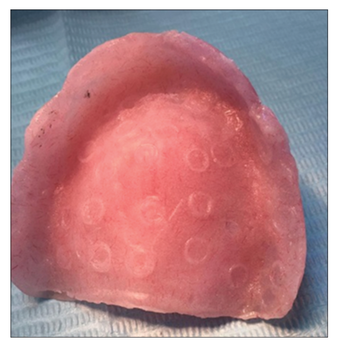
Figure 2: Trephination holes in cast

The data of this study were shown as a mean and standard deviation (SD). The results showed a normal