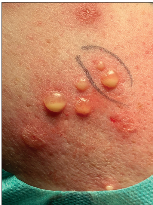
Figure 2: Flaccid pustules and small bullae with hypopyon

1 and 3, IgG and IgA antibodies to gliadin and tissue transglutaminase were negative. Antibodies to BP 180 were negative, while antibodies to BP 230 were positive on admission, but negative 5 days later.