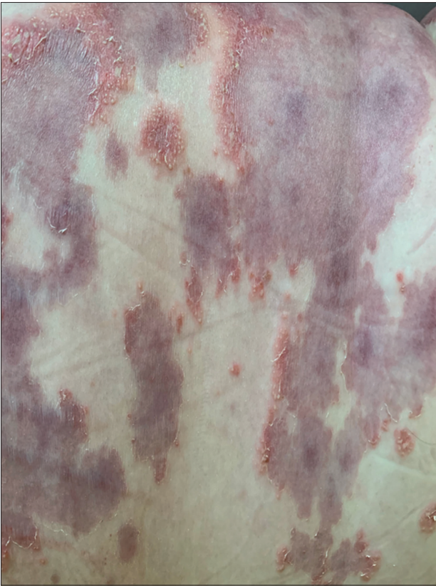
Figure 3: Dramatic improvement within 24 h of dapsone treatment

viral infection may have been the trigger since we observed a temporary lymphopenia. The most obvious finding is a massive activation of neutrophils in skin and peripheral blood [3].