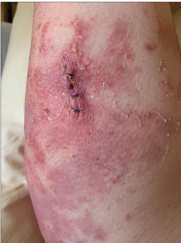
Figure 4: Detail of the skin biopsy area. Most pustules cleared and the inflammation diminished

viral infection may have been the trigger since we observed a temporary lymphopenia. The most obvious finding is a massive activation of neutrophils in skin and peripheral blood [3].