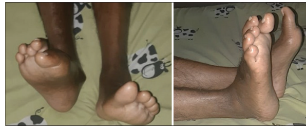
Figure 5: Patient no. 6 had external fixation removed with satisfying pain relief and hence, improvement of American Orthopaedic Foot and Ankle Score. Ulcer also healed well

As for the second assessment, the mean period was 15.02 months (range, 11.27–16.8). Limb salvage rate is still 100%. Three patients had external fixation removed with one of them undergoing arthrodesis. One more patient needed external fixation revision for loosening of pins on dorsum pedis. Three other patients were lost to follow-up. Mean VAS was 0.75 (range, 0–2). The mean improvement of VAS compared to last follow-up was 1.75 (range, 0–3). Mean AOFAS score was 66.25 (range, 57–77), with all patients experiencing score improvement of 8.5 (range, 5–12). Ulcer wounds healed satisfactorily for all patients (Figure 5).