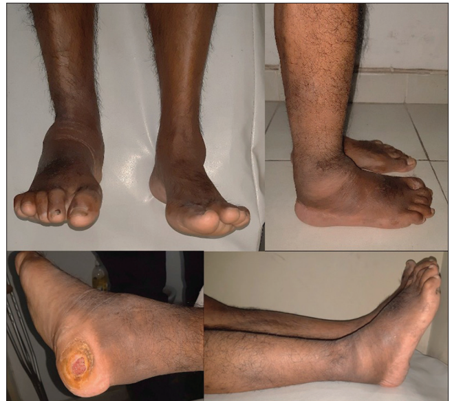
Figure 2: Pre-operative picture of Patient no. 6 showing swollen and deformed ankle, also ulcer on posterior side of heel

Operative treatment consisted of debridement, followed by external fixation only (n = 4) (Figure 3), combined external fixation and pinning (n = 2) (Figure 4), and intramedullary pinning only (n = 1). The mean hospital LOS was 4.5 days (range, 3–7).