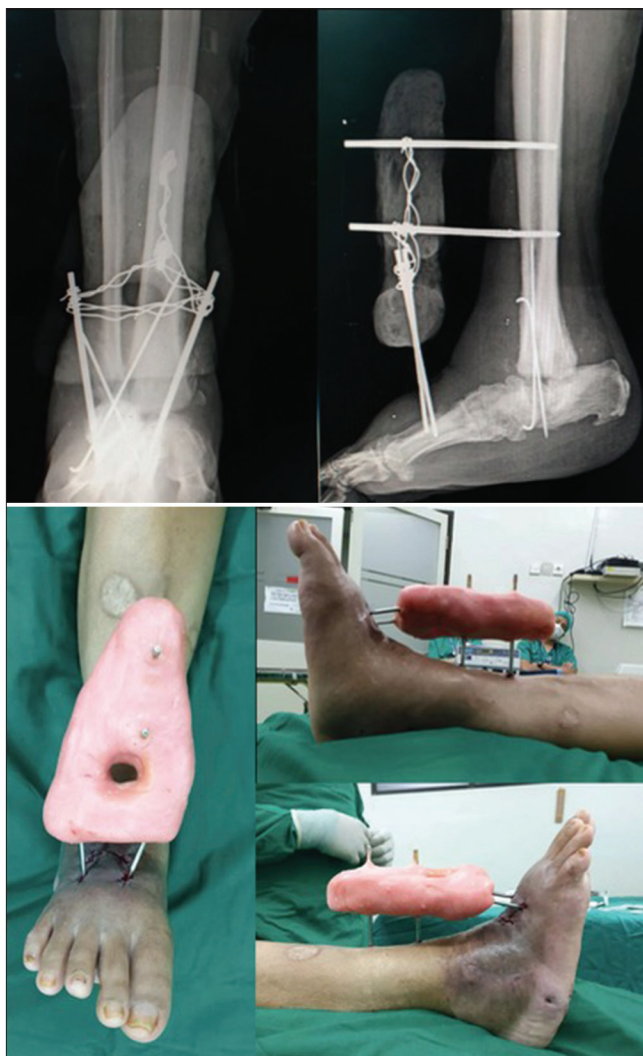
Figure 4: A 43-year-old woman (Patient no. 3) whose talus and tarsal bones were destructed due to charcot neuroarthropathy underwent debridement. Patient's ankle and foot was fixated in plantigrade position using half pins external fixation. During hospitalization period, patient's blood glucose was uncontrolled and there were clinical signs of infection, therefore a multidisciplinary approach of surgeons and endocrinologists were applied. Patient reported improvement in terms of pain and function after a period of 4 months

LOS: Length of stay, VAS: Visual analog scale, AOFAS: American Orthopaedic Foot and Ankle Score.