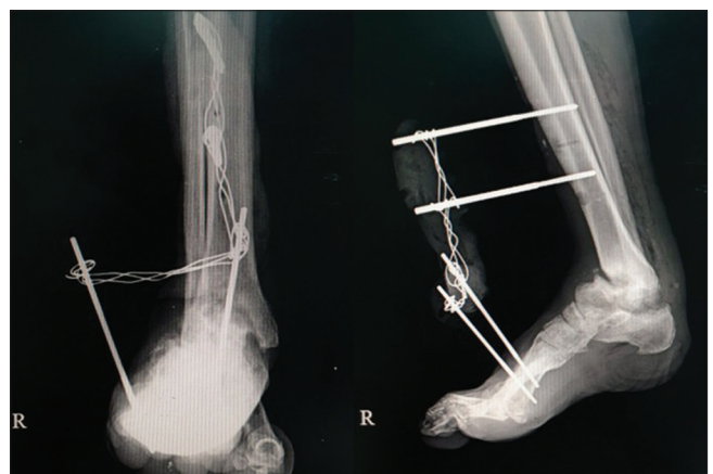
Figure 3: Patient no. 6 had external fixation with half-pins to fixate his ankle joint while waiting for the blood glucose level and infection to be under control and to continue with definitive fixation. Half-pins were implanted on his tibia and metatarsal bones, then strengthened with wires and methyl methacrylate

After a mean period of 4.56 months (range, 1.3–5.3), we performed the first assessment. Limb salvage rate was 100%. One patient needed revision of external fixation due to loosening of pins on dorsum pedis by this time. We assessed the pain scale with VAS and the functional outcome through AOFAS score.