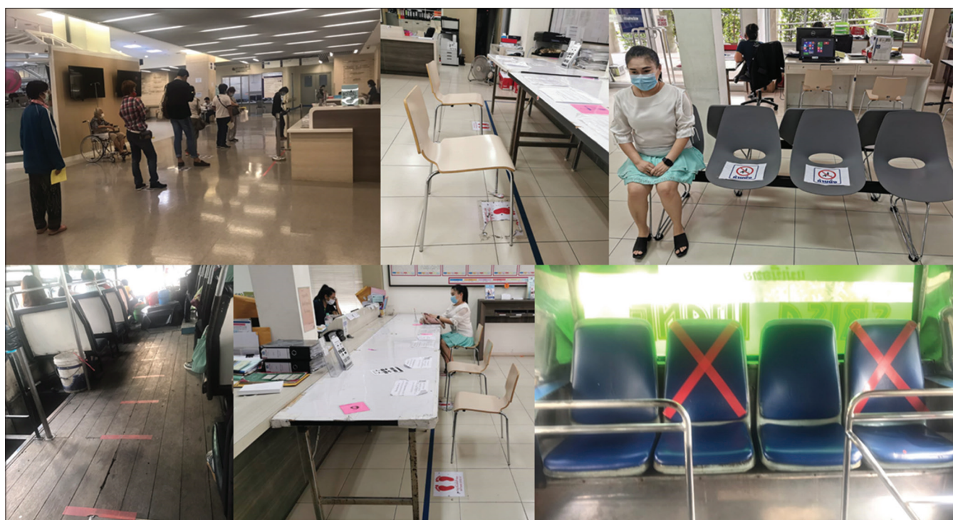
Figure 2: The social distancing of 1-2 meters for COVID prevention in Thailand

Oral health is affected in the pandemic and disaster situations similar to the situation of the