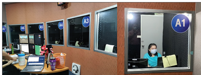
Figure 3: Online delivery of lecture for prevention of COVID

COVID-19 pandemic [25], [26]. Hence, the dentist should manage oral health problems and prevent the spread of COVID-19 in dental practice. Figure 4 shows patient screening flow chat for COVID-19 and dental treatment [23]. A detailed medical history of the patients and their family members should be asked upon their arrival in the dental clinic, such as contact with COVID-19 infected people, history of fever, and travel history in the last 14 days.