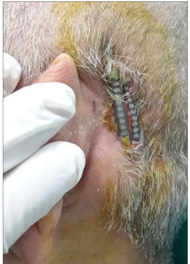
Figure 2: Surgical site erosion in left postauricular region and protruded lead from