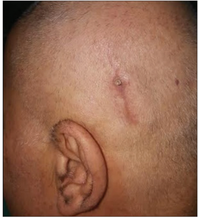
Figure 3: Surgical site erosion in left postauricular region and protruded lead from skin

A 62-year-old female patient with Parkinson's disease was implanted DBS to bilateral STN. In the post-operative 4 th month, there was surgical site erosion on the left postauricular incision, and the lead was protruded from the skin. Hence, IV antibiotherapy and surgical site revision were performed on the patient, and the lead was transported to the subcutaneous tissue. No agent was determined in the sample which was taken from the wound. Clinical findings and laboratory values of widespread or central nervous system infection were never observed. The patient who completed the 1 st year of her operation is followed up as an outpatient without any problem.