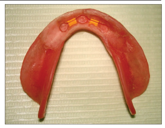
Figure 2: Retentive clips picked-up in denture fitting surface