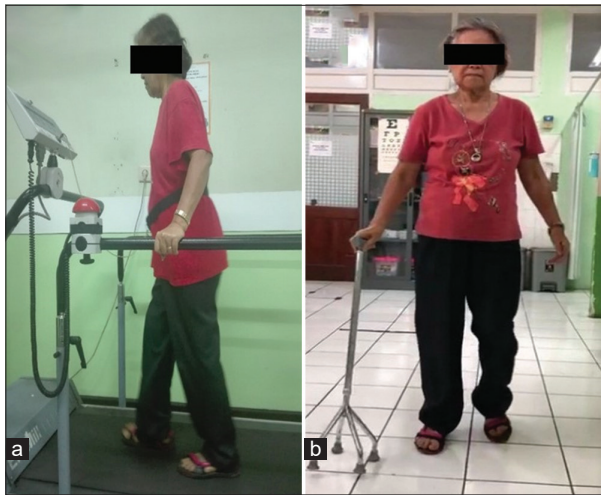
Figure 3: Targeted intervention. (a) Our patient exercises with the treadmill and (b) walks with the quadripod cane

interventions for identified contributing factors, which could decrease falls by 30–40 percent. The treadmill was used as one of the habituation interventions for this patient to improve the walking pattern (Figure 3a).