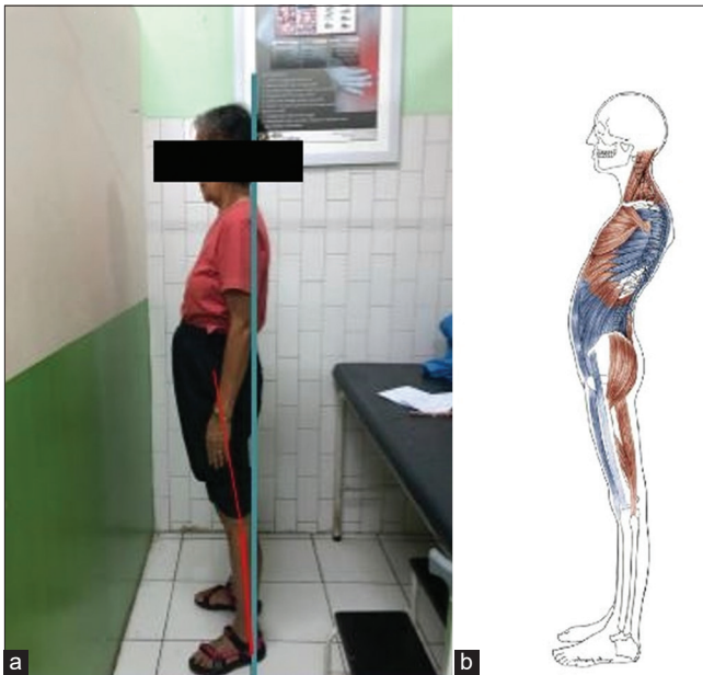
Figure 1: Image of kyphotic pelvic. (a) Sway Back Posture lateral view of the patient in this case report that leads to falling. (b) Schematic representation of the shortened (red) and lengthened (blue) skeletal muscles [2]

urinary disturbance score was 1 (pollakiuria or urinary urgency) [3].