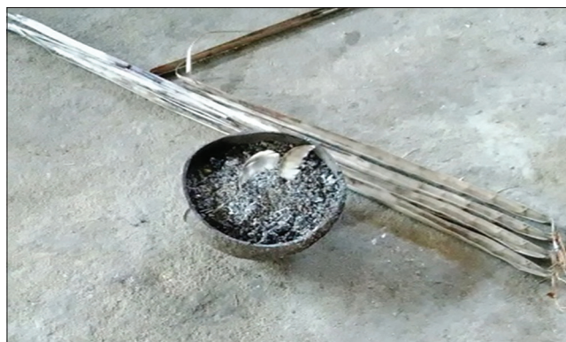
Figure 6: The container to burn incense

According to the shaman, these components symbolize the close relations between humans, nature, living and non-living creatures. It means that humans must preserve nature to prevent destruction and to live well (Interview with Siprianus Ngae, April 19, 2020) (Figure 6).