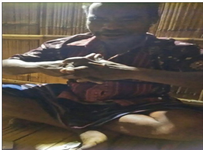
Figure 2: The shaman's gesture while he asks the patient's activities

patients become ill due to the disturbances of genies by measuring his chest to his right hand using the span of his left hand ( paga ) while reading spells (Figure 3).