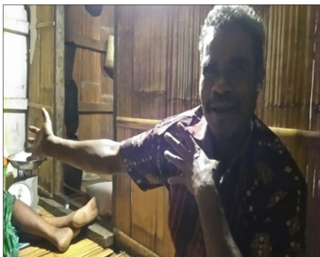
Figure 3: The shaman measures using the span of his hand

patients become ill due to the disturbances of genies by measuring his chest to his right hand using the span of his left hand ( paga ) while reading spells (Figure 3).