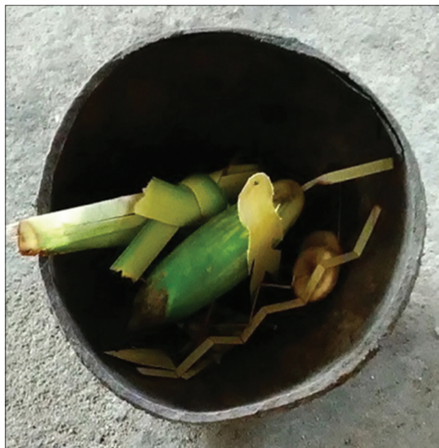
Figure 5: The items are placed in a container

After this process, the patient must prepare some material things that symbolize humans or genies: Pandanus leaves, eggplant, sticks, container, golden coins from bananas, necklace from Pandanus leaves, white rice, banana slices that symbolize golden coins, a short tail that symbolizes pigs, a long tail that symbolizes bulls, and kitchen ash. They are put in the stick screws to resemble cattle (pigs and bulls) (Figure 5).