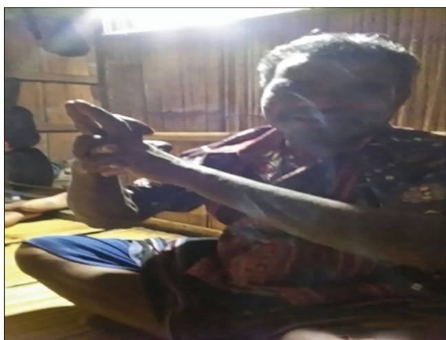
Figure 4: The shaman finds the cause of illness

Then, the shaman measures the accuracy of the meeting between the two hands' fingers (Figure 4).