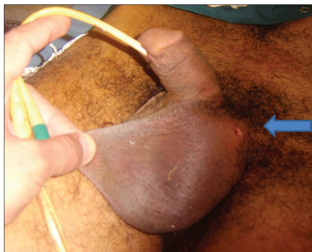
Figure 2: Bullet injury of external genitalia was managed conservatively

Six cases (17.6%) were treated conservatively without any surgical intervention, 4 (66.7%) of them were caused by bullet injuries. The overall testicular salvage rate was (50%).