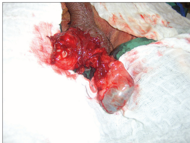
Figure 1: Blast injury of external genitalia after cleaning

Explosive devices were the cause of injury in 23 patients (74.2%) Figure 1, while bullets were the cause in the remaining 8 patients (25.8%) Figure 2.