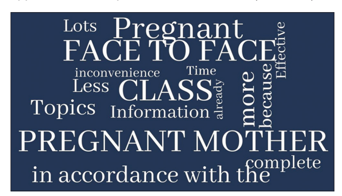
Figure 1: Words that often appeared

Below is Figure 1 containing words that often appeared in FGD process with midwives (Picture 1).