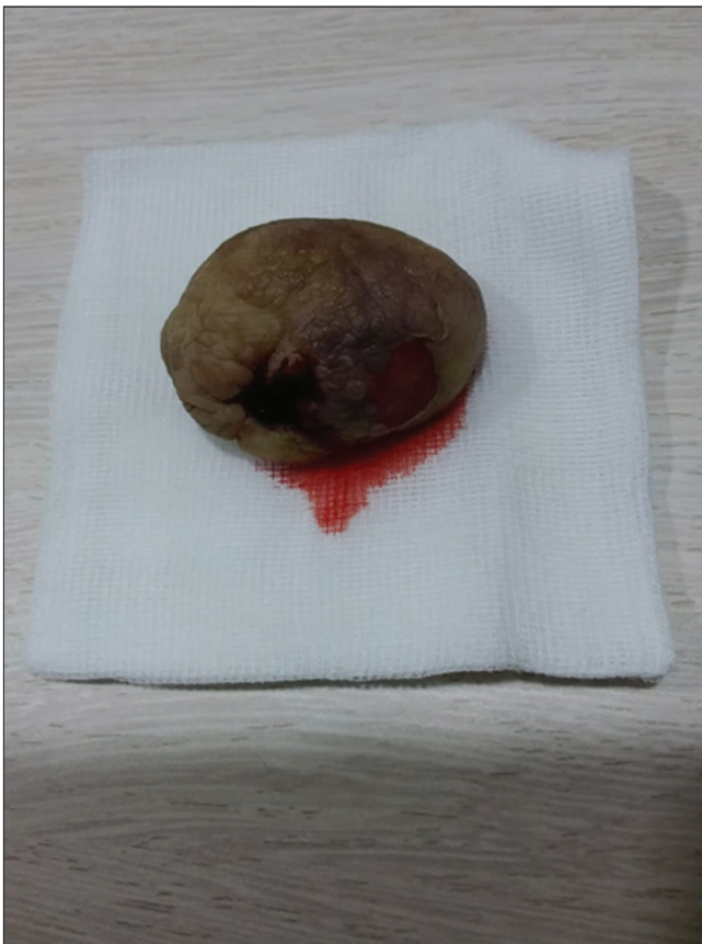
Figure 6: Giant acrochordons after surgery

We performed USG examination and found multiple lymph nodes on the right inguinal with various sizes 0.81–0.85 × 1.0 cm, no sign of inguinal hernia. On complete blood examination, leukocytosis was found; other findings appear normal.