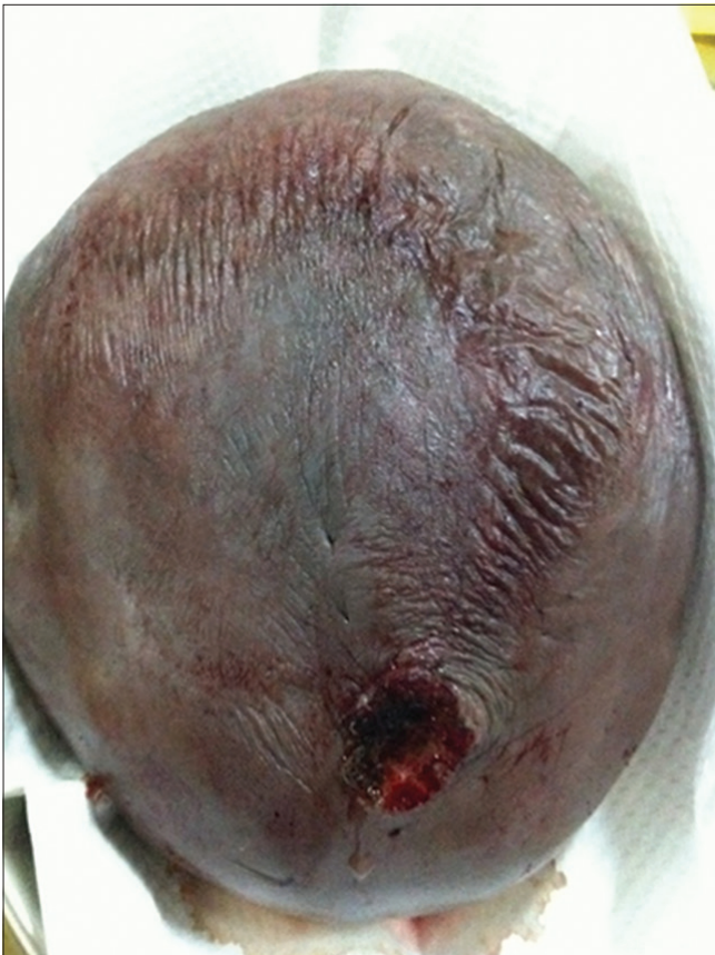
Figure 2: Giant acrochordons after surgery