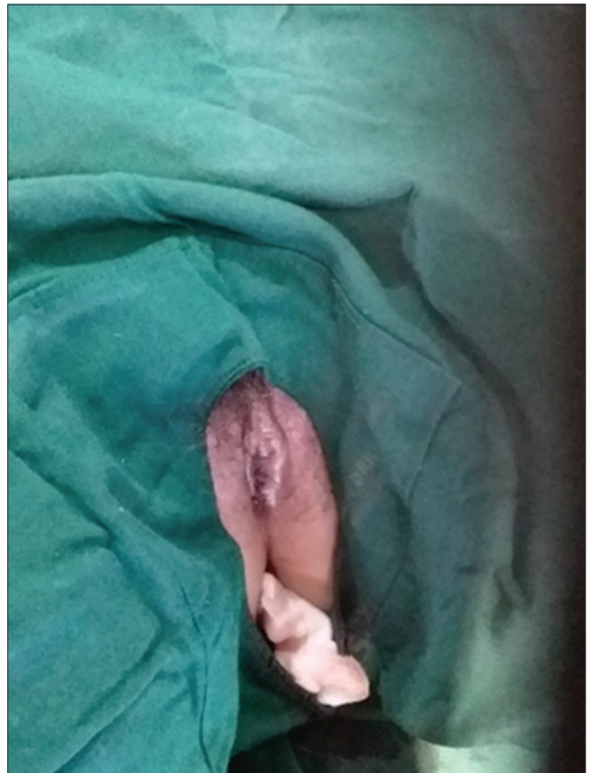
Figure 4: Giant acrochordons after surgery