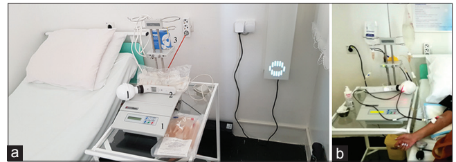
Figure 1: (a) 1 – Hemofenix device, 2 – Rubin Laser, and 3 – PFM 500 filters; (b) Presentation of apheresis procedure

According to perform diagnostic procedures, it was indicated treatment with membranous apheresis at the institute "Dr Simo Milosevic" Igalo. After the patient was acquainted with the technique of performing the procedure, the expected results, and possible risks, she signed the consent and the treatment began on April 14, 2021. The procedure consisted of four cycles of membranous apheresis on a Hemofenix device (Trackpore Technology, Russia) (Figure 1a-1) with PFM 500 filters (Plasmofilter, Russia) (Figure 1a-3) performed every other day in the period from April 14, 2021 to April 20, 2021. Before each cycle, the patient had premedication which consisted of 5000 IU Heparin in a bolus with 5000 IU Heparin in 500 ml saline. In