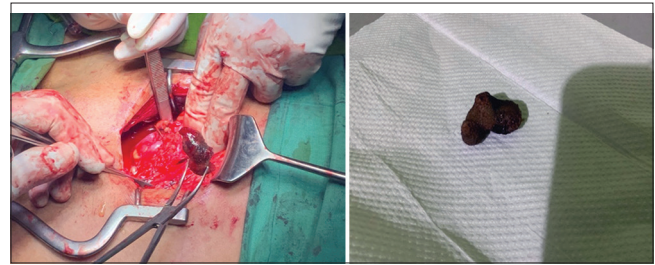
Figure 2: Pyelolithotomy surgery and the appearance of stones in the right kidney after removal

The pyelolithotomy method is chosen to remove staghorn stones in the right kidney, 4 cm x 2.3 cm in size (Figure 2). This stone is suspected to be the cause of pain and fever symptoms inpatient. One week after surgery, the patient recovered with no complications encountered.