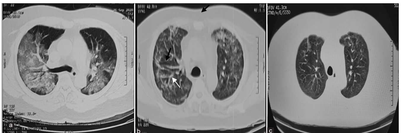
Figure 2: (a) First, the Computed Tomography (CT) Scan lung window was performed on September 26, 2020 showed the ground-glass opacity in both lungs and interstitial thickening bilaterally as compared to, (b) CT scan on November 18, 2020 showed decreased ground-glass opacities in both lung, interstitial thickening (white arrow) and traction bronchiectasis (black arrow) in the right lung. (c) CT scan on July 2, 2021 showed decreased and improvement of ground glass opacities, interstitial thickening, and traction bronchiectasis compared to Figure 2b

Although ARDS appears to be a major predictor of fibrosis in COVID-19, several studies showed that COVID-induced ARDS is different from classic ARDS. Chest CT findings in many COVID-19 cases are also not suggestive of classical ARDS. Along with, abnormal coagulopathy is another pathological feature of this