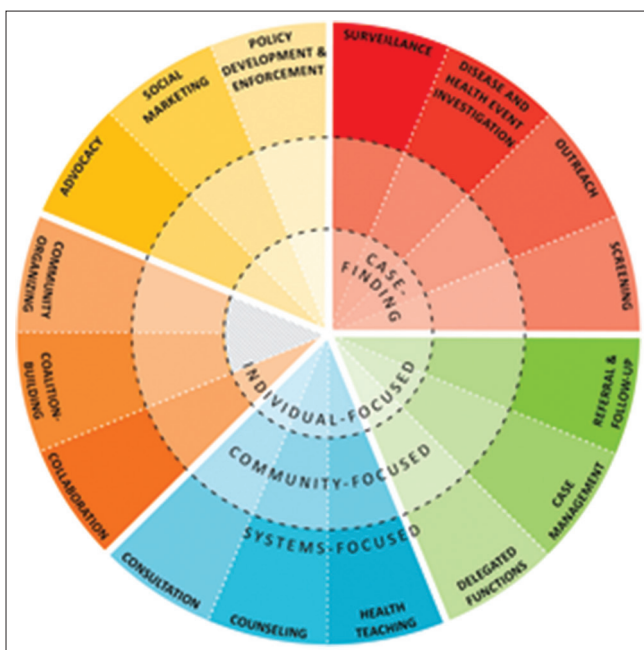
Figure 2: Intervention Wheel model [27], [28]

Another study on nutrition education interventions was conducted in Indonesia. Nursing staff for infants aged 6–17 months were randomly assigned to a nutritional intervention on the nutritional practices and nutritional status of the children combined with regular home visits by managers. The study showed that the pedagogical intervention had a significant impact on the children's food diversity dietary diversity score (DDS) scores. The children in the intervention group had a higher DDS than the children in the control group (beta [mean difference] = 0.34, 95% CI: 0.02–0.66, p = 0.038). The result of this study was that the prevalence of stunting increased in the control group, but remained stable in the intervention group. The nutrition education intervention has great potential to integrate other nutrition programs into community health centers [18].