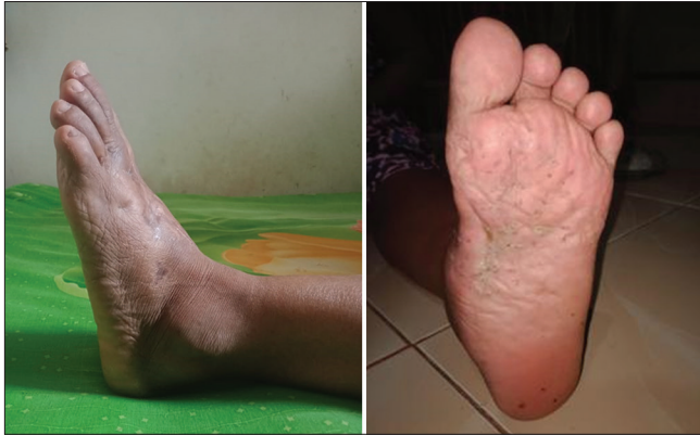
Figure 4: Complete resolution after 26 weeks of combination therapy

pharmacological medications from the orthopedic department were discontinued. Nevertheless, the antifungal medications were continued. After 26 weeks of systemic itraconazole therapy, the skin lesions have completely improved (Figure 4); then, itraconazole therapy was discontinued. Patients were informed to routinely use the footwear to seek medical attention immediately if complaints recur.