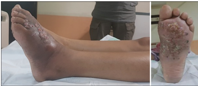
Figure 1: Clinical presentation of eumycetoma on the left foot

The general physical examination revealed normal findings. Dermatology examination exhibited painful multiple discharge-draining nodules, surrounded by ulcers and pustules with crust, over edematous skin on the dorsum, and plantar pedis (Figure 1). However, the typical macroscopic "grain" finding was not found from the patient's wound.