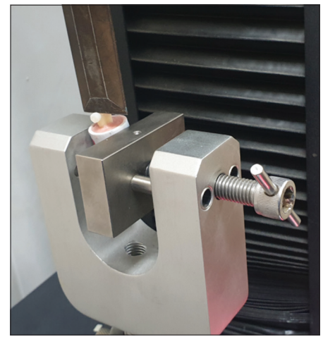
Figure 1: Photo of the Instron testing machine used to measure the shear bond strength of the prepared samples

Fourteen specimens from each bonding system applied samples (seven desensitizing treated specimens and seven control) were stored in distilled water at 37°C for 24 h, another 14 samples were stored for 7 days and the remaining 14 samples were stored for 72 days. At the end of each interval, the shear bond strength of each sample was tested using an Instron universal testing machine (TH-8203S, China) (Figure 1). During testing, the long axis of applied force direction was perpendicular to the composite cylinder with the knife-edge being located at the compositedentin interface, the strength of bonding will be measured in shear mode at across -head speed of 0.5 mm/min until failure occurs. Data were analyzed using the Independent t-test. One-way analysis of variance (ANOVA) Test, and Duncan's Multiple Range Test. The statistical procedures were analyzed with a significance level at p < 0.05 using "IBM SPSS Statistics 23 Software."