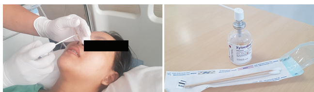
Figure 1: Sphenopalatine ganglion block procedure

We planned for intranasal SPGB after informed consent [MOU1]. We obtained histories of coagulopathy, nasal septal deviation, polyps, nasal bleeding, allergy to local anesthetics, local nasal infections, and base of skull fractures before the intervention. We performed the procedure on the patient supine with the neck extended by placing a pillow beneath both shoulders. We chose Xylocaine 10% Pump Spray® (lidocaine 100 mg/ml) as it contains a higher concentration of local anesthetics, and then, we applied it using a long applicator with a cotton swab tip. We inserted the needle parallel to the nose's floor and placed the swab above the middle turbinate on the posterior pharyngeal wall. The applicator was left in place for 5–10 min before removal. We also performed the procedure in the opposite nostril (Figure 1).