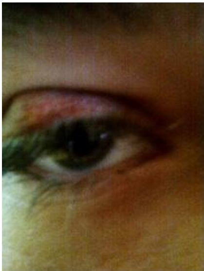
Figure 1: Superior right eyelid - redness, swollen, hard nodules and linear perilesional hypo-pigmentation caused by Kenalog-40.

On examination, the superior portion of his right eyelid was erythematic and swollen, as well as warm and hard to palpation nodules (Figure 1).