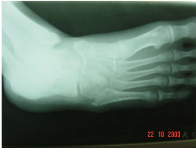
Figure 1: The base of the fifth metatarsal shows avulsion of apophysis caused by over traction of peroneus brevis tendon. The bone fragment is not completely detached from the main metatarsal bone.

moderate doses were given and complete relief of pain was seen in ten days after the first visit.