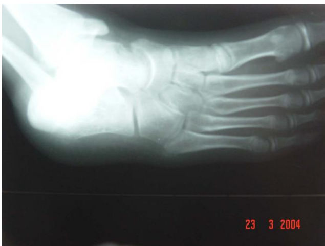
Figure 2: X-Ray of a 12 years old girl with typical finding of avulsed bone from the base of the metatarsal.

The foot was splinting for two weeks and the child was much better with no pain and a localized tenderness which disappeared in two to three weeks.