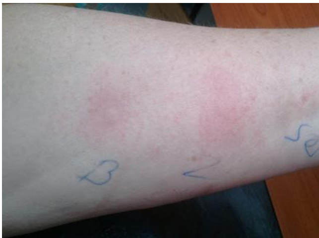
Figure 1: SPT (prick by prick) with wheat.

The patient hematological and biological blood tests were normal. The level of serum tryptase was 4.5 ng/mL (normal range values < 11.4 ng/mL). The detailed allergic and immunologic exams results were as following: Commercial SPT for inhalant and food allergens (Lofarma, Milan) showed positive response for wheat proteins 8-30 mm. The level of wheat-specific IgE detected by ImmunoCAP (UniCAP PHAD® Pharmacia & Upjohn, Uppsala, Sweden) was of class 3, and gluten-specific IgE were of class 2. Meanwhile, ω-5 gliadin-specific IgE was increased class 4. IgA anti-tissue transglutaminase, IgG anti-tissue transglutaminase, and IgG anti-gliadin were negative, whilst IgA anti-gliadin was positive. For SPT (prick by prick) with wheat, we used freshly made suspensions of flour and saline (1:10) and we got a positive response (6-32 mm).