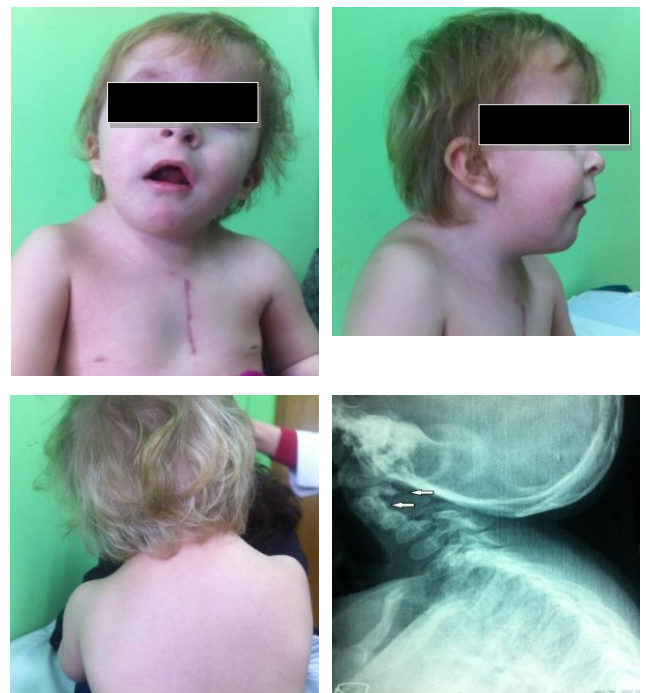
Figure 2: Case 2. Patient with Klippel-Feil syndrome and anomaly of the occipito-cervical junction. The images show an elevated left shoulder due to a Sprengel anomaly, a short, webbed neck, and a low hairline. (Scar on the thorax after surgical repair of nonrestrictive atrial septal defect). X-ray shows occipito-cervical junction.

Case 2. A 28-month-old girl, as the fourth child, from normal pregnancy and absolutely health parents, weighing 16.3 kg, during the routine pediatric examination systolic murmur was noted and for cardiological examination at tertiary level was referred. The child’s growth and development was completely normal. There was no sweating or fatigue during feeding or normal activities. Complete clinical and cardiological examination was obtained. Objective examination of other children is in normal limits.