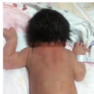
Figure 4: A 2-days old neonate with Klippel-Feil syndrome. The image shows an elevated right shoulder due to a Sprengel anomaly, a short, webbed neck, and a low hairline.

Echocardiography revealed situs solitus, levocardia, atrioventricular concordance and transposition of the great arteries with patent ductus arteriosus. At the third day of life balloon atrioseptostomy was performed and 7- 8 mm communication between atria was achieved. In the lack of cardio surgery services in Kosovo and financial impossibility of family to cover surgery abroad Kosovo, baby dies after 2 months as a consequence of congestive heart failure and respiratory infection.