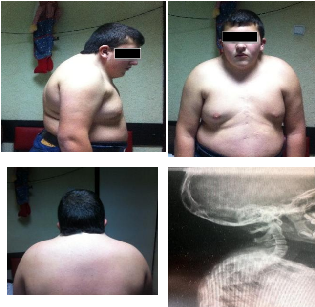
Figure 1: Case 1. A 15-years-old boy diagnosed at delivery with Klippel – Feil syndrome. Note the short neck, low hairline and symmetric shoulders. (Scar on the thorax after surgical repair of total anomalous venous return).

Despite being ventilated on 100 % oxygen, pulse oximetry could not be raised above 80 %. Hence, a prostaglandin infusion was commenced. Physical examination showed a short neck, low hairline at the back of the head, and particularly restricted mobility of the upper spine. Cardiovascular and respiratory examination was normal.