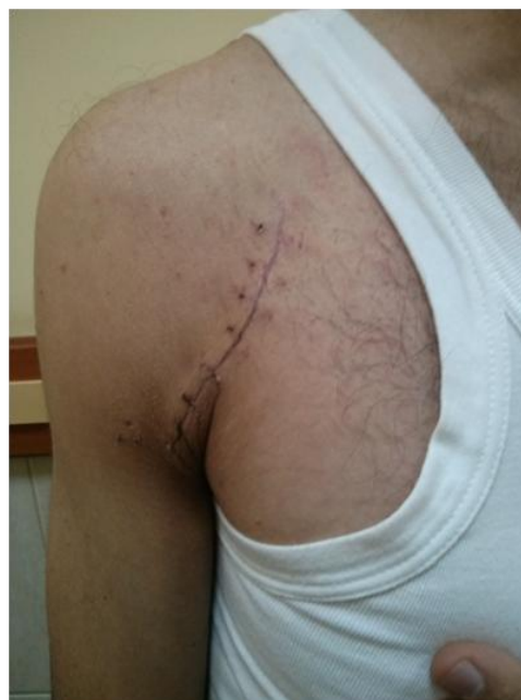
Figure 2: Two weeks after surgery 35 years old patient

depending from the bone structure and pattern of coracoids process. The osteotomy can be made with an oscillating saw or with a good slightly curved 15 mm osteotome. We have used both with excellent cut and with no complication from fractured coracoids process.