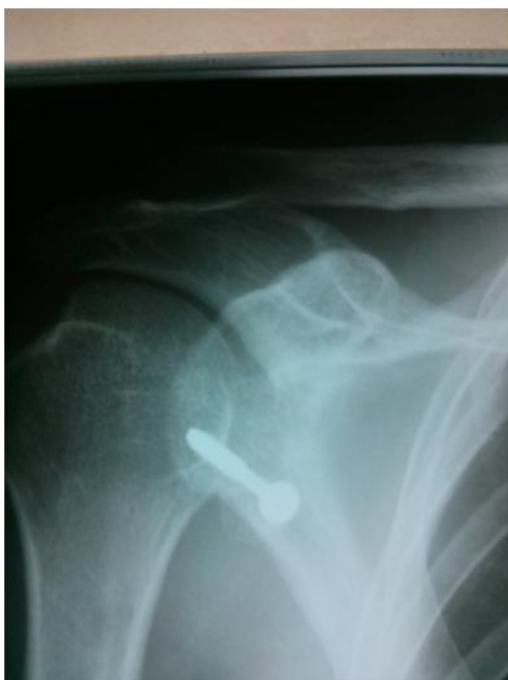
Figure 4: Ideal placement for titanium screw just below the equator line

We prefer to put the graft in “standing” position and fixing with one screw, providing a good denuded scapular surface and cancellous coracoid. We have seen no fibrous union and no bone fracture. The only difficult momentum may be the possible rotation of the coracoid piece, which can be eliminated by a stand grasping in the last phase. With the arm in external rotation, the tendon of the subscapularis was horizontally split (Fig. 3).