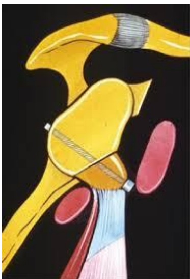
Figure 1: Coracoid transfer anterior to glenoid rim fixed with a single screw

We intend to evaluate the functional and clinical outcome of the Bristow-Latarjet procedure in patients with glenohumeral instability treated surgically.