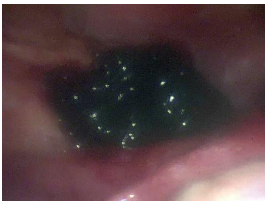
Figure 2: Secondary abdominal pregnancy

Ovarian stimulation was carried out applying a short protocol with GnRH-antagonist and recombinant FSH preparation. Embryo transfer of two embryos was performed at 72 h after the puncture with 20 \mu l medium (BlastAssist®, Origio; Denmark) by Wallace catheter (Smiths Medical International, United Kingdom) and transabdominal ultrasound control, the embryos being transferred at 1-2 cm from the fundus. Serum level of \beta -HCG was measured on day 13 after ET (720 mIU/mL) and pregnancy quality test showed positive result (06.12.2013). The first transvaginal ultrasound scan (13.12.2013) was done in day 23 after the ET and no intrauterine pregnancy was identified in the presence of scarce genital bleeding (decidual reaction). An ectopic gestational sac containing a yolk vesicle and located adjacent to the uterine and left adnexa was imaged (Fig. 1).