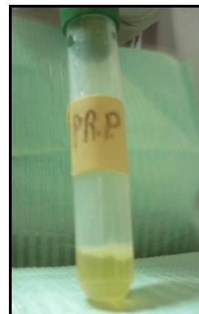
Figure 1: Prepared PRP

PRP was prepared one hour before the surgical phase. Ten ml of autologous venous blood was drawn of the antecubital vein. Blood was collected in a sterile tube containing 10% Tri-sodium citrate solution anticoagulant. The blood sample was introduced into a differential blood counter (Medonic CA, 6201530, Sweden) to count the platelets before PRP preparation. It was 237.0000/\text{mm}^3 .