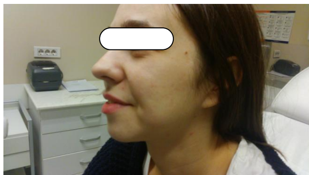
Figure 2: After 3 treatments with fractional carbon dioxide laser