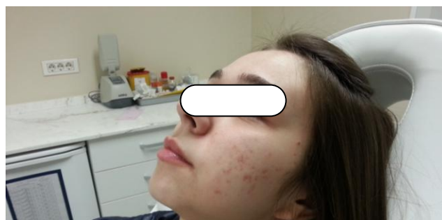
Figure 1: Before laser treatment

The success of treatment is objectively seen in photographs taken before and after the treatment.