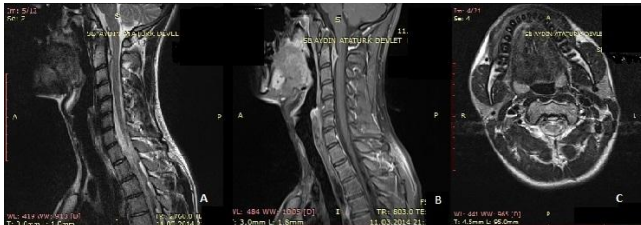
Figure 2: The control cervical MRI showing regression of meningioma in T2 weighted (A), T1 weighted sagittal (B) and axial (C) images

There were no neurological deficits or subjective complaints related to the tumor. Since he had no complaints and didn't want any kind of surgical approach, the meningioma was followed by a control MRI. After three months the control cervical MRI revealed the regression of the meningioma (Figure 2 A,B,C).