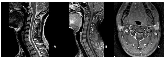
Figure 3: After six months cervical MRI showed complete regression of meningioma in T2 weighted (A), T1 weighted sagittal (B) and axial (C) images with linear contrast enhancement without any solid lesion

The length of the lesion regressed to 35 mm with a sagittal diameter of 6 mm without any signs of hemorrhage and calcification. In his third MRI after six months the lesion was completely regressed (Figure 3A,B,C).