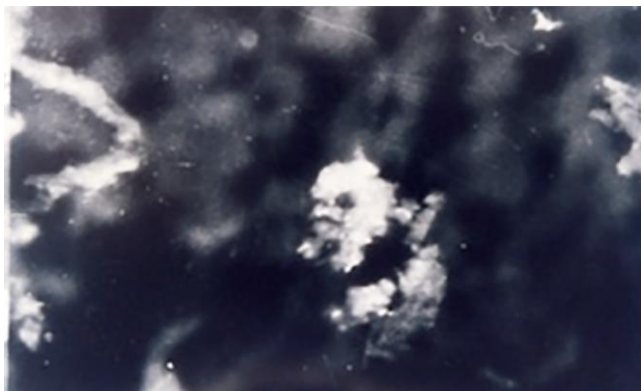
Figure 4: Deposits of immunoglobulin C3 by the length of the epithelial basement membrane and superficial layer of the lamina propria at oral lichen planus

The patient was suggested not to receive food or drinks in the next 20 minutes, and gel to be protected by sterile gauze. Also we administered Nystatin, 4 times per 25 drops orally, due to prevention of candidiasis.