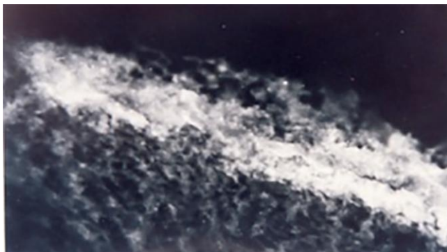
Figure 3: Deposits of immunoglobulin G by the length of the epithelial basement membrane and superficial layer of the lamina propria at oral lichen planus

times a day after eating (after they get a check, manually check dinners), with previous rinsing with Clorhexidine gluconate 0.12 %.