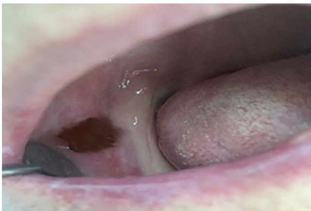
Figure 5: Application of the NBF gingival gel at the site of the buccal mucosae lesion

Systemic application of corticosteroids at this moment was avoided (Figure 5).