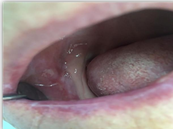
Figure 1: Erosive lichen planus in the retro molar right buccal mucosa

immunofluorescence. Histopathological researches of buccal mucosa confirmed: canceled epithelium, degenerative changes in basal layer, and the individual basal cells atrophic-term changes.