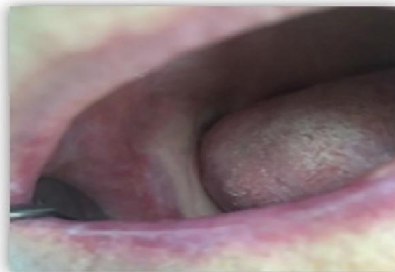
Figure 6: Healed mucosal lesion after third week of therapy with NLB gingival gel

After the third week there were no lesions to detect on the oral mucosa, yet still present slight redness, which completely pulled after the fourth week. Treatment ended after the fifth week when the topical application of the NBF gingival gel was terminated, and therapy was done (Figure 6).