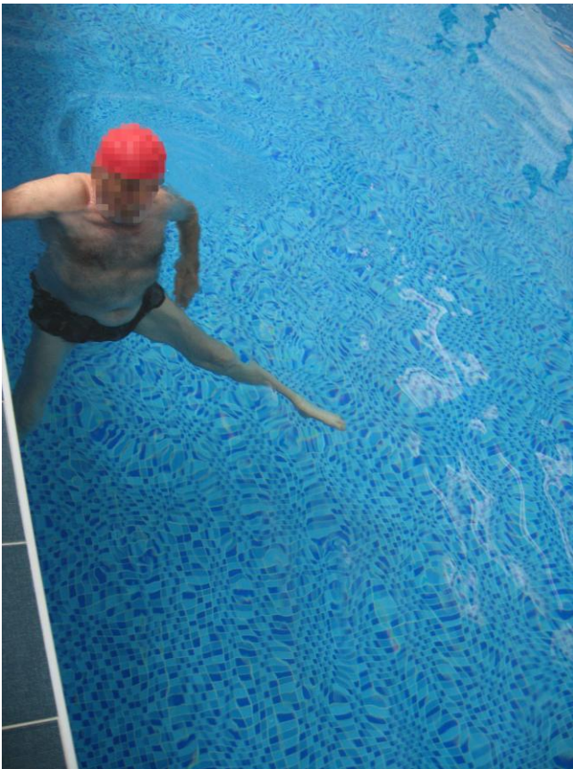
Figure 2: Water exercises for lower extremities in the pool

Upon dismissal, the patient had subjective improvement, but the clinical findings of the patient indicated no significant improvement in the lower leg muscle strength, no changes in MMT, swelling decreased in the left ankle, no pain in the left ankle. The patient's gait was more stable with below-knee plastic orthoses. Barthel Index scores 80, Timed Up and Go test 12.3 sec. Walking time at a distance of 6 m. was 9.14 sec.