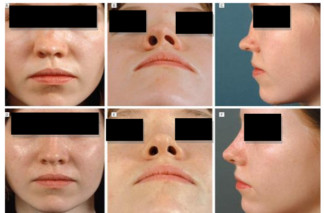
Figure 8: Fourteen years girl. Rhinoscoliosis and rhinolordosis (after nasal trauma). Graft (from auricula) augmentation on the nasal dorsum

The aim to perform rhinoplasty in children is to restore the anatomy and function or to promote normal development and outgrowth of the nose. The ideal situation for every surgeon is to wait for the surgery to be performed till after the pubertal growth spurt.