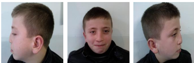
Figure 3: Saddle nose (rhinolordosis) due to untreated septal hematoma after the nasal trauma in early childhood (with the permission of parents)

Actual indications are severe congenital malformations of the nose, recent traumatic deformities, external distortion of the nose due to septal abscess, breathing problems due to septum pathology, cleft lip nose, dermoid cysts.