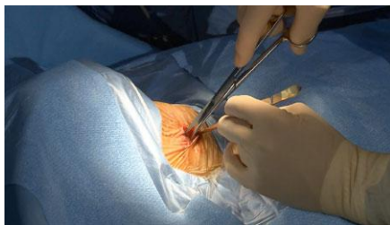
Figure 2: Shadowless lighting will be set according to the spotted path of the disc space

Shadowless lighting will be set according to the spotted path of the disc space. This trajectory will guide the surgeon to find the correct level of the disc (Fig. 2).