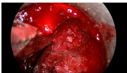
Figure 5: Nerve root is completely decompressed and exposed from the spinal canal to the vertebral artery

foraminotomy from lateral to medial to avoid inadvertent injury to the vertebral artery. The surgeon should be assured that Uncus is sufficiently open.