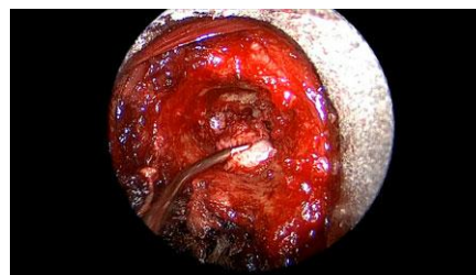
Figure 4: Using a hook, the herniation is dissected and removed by a disk forceps

The inner portion is attached to the speculum and the rest of the procedure is carried out under endoscopic control. The first instrument used is an endoscopic drill (5 mm diameter 125 length drill). Drilling starts at the level of the disk or slightly above it, following the direction of the disk in an anteroposterior direction. This drilling is extended in order to perform a hole of approximately 8 mm. The soft tissues are resected using a 45° angled Kerrison rongeur or a disk forceps. When the posterior border of a vertebral body is reached and the posterior longitudinal ligament is uncovered bone resection will be expanded laterally using a 45°, 2 mm Kerrison rongeur. At that time, disk herniation will be identified. To get an assurance that there is no adherence between the disk herniation and dural sac, the surgeon can use a hook that can be dragged between the herniation disk and dural sac. After that the disk herniation removed by hook and disk forceps (Fig. 4).