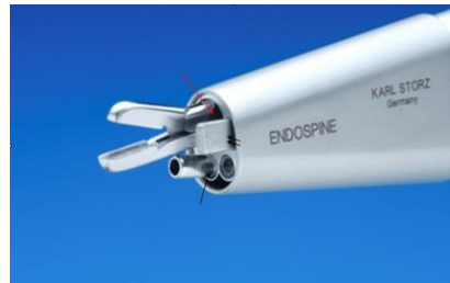
Figure 3: Endospine with three channels, red arrow for surgical instruments; black arrow for suction; double arrow: for nerve root retractor

the lateral and medial position to protect oesophagus and carotid. From this time on, Endospine will be inserted and will be placed between retractors. Endospine is the material designed by Destandau. It is composed of a speculum and an inner portion. This portion serves to support the endoscope (4 mm) and includes three other channels: one for suction, the other for surgical instruments and the last for root nerve retractor (Fig. 3). The first speculum will be placed.