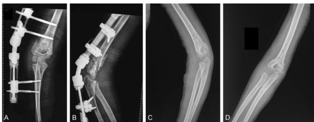
Figure 2: A) and B) Radiography at postoperative week 1 shows a good reduction of the fracture. C) and D) Radiography at postoperative week 6 shows the good union of the fractured ends without any deformities.

Radiographic examination was performed every week after the surgery. The patient was encouraged to practice movement of the hand and arm with a static load. The elbow joint was alternatively fixed at the position of maximum flexion or extension after physical therapy every day. The external fixator lock was removed at postoperative week 3. At postoperative week 6, the external fixator was removed. At the follow-up examination, the wound showed signs of primary healing. No radiological or biochemical evidence of infection was obtained during the 6-month follow-up period (Fig. 2A, 2B). At the last follow-up examination, the patient showed radiographic evidence of good union (Fig. 2C, 2D); had a range of movement of 0°-145 at the elbow; and did not have any signs of osteomyelitis or varus or valgus deformity. Informed consent has been obtained from the patient or appropriate persons for publication, including photographs.