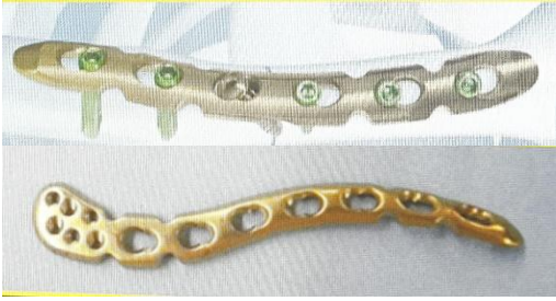
Figure 3: LCP Superior Anterior clavicle plate and LCP with lateral extension

plate [11]. So they were very useful (Fig. 3).