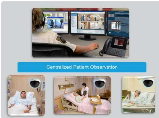
Figure 4: Monitoring station for multiple locations with a hospital

Onlookers by and large get time-based compensation, an unreimbursed cost. Some human services offices must request that the patient's family give sitters, forcing a weight for working relatives. Healthcare services associations can bring down the expenses of patient perception utilising top notch (HD) video reconnaissance and two-way correspondences. With the perception arrangement, prepared staff in a focal operations focus can watch various patients over the office's current system, rapidly alarming staff when intercession is required. Figure 4 shows the centralised patient observation setup. Healthcare industry can greatly benefit from cloud-based surveillance, especially from video analytics software such as motion analysis. The authors Lee, and Chung, 2012 [24] developed an algorithm capable of detecting falls of patients in healthcare institutions and removing shadows from objects thus greatly increasing false detection. Such a system of detection can be implemented to monitor patients movement in real-time by automatically notifying hospital staff of unfortunate event such as falling or undesired movement.