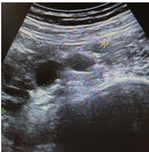
Figure 1: Transabdominal ultrasonography showing a multilocular cyst with incomplete septation

Transabdominal sonography showed uterus with normal echostructure, measuring 64x52x38 mm. Endometrial thickness was 5 mm. Left ovary measured 20 x 15 x 10 mm and had normal echostructure. Unilateral heterogenous longitudinal mass, multilocular cyst with incomplete septation showed in the right adnexa, and the mass measured 7.2 x 4.6, which suggested right tube-ovarian abscess.