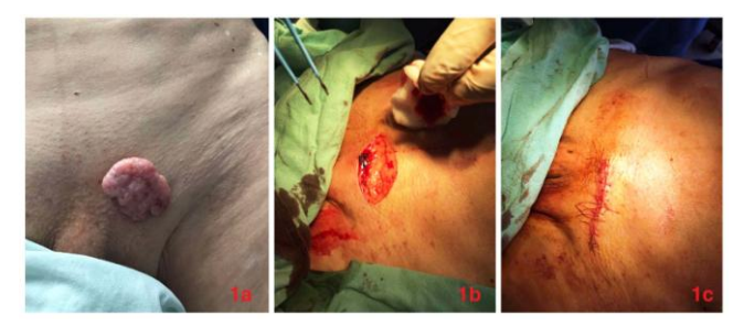
Figure 1: 1a) Cutaneous tumour in the left inguinal region; 1b) Elliptic surgical defect after haemostasis, ready for reconstruction; 1c) Primary closure of the defect with interrupted non-absorbable sutures

papillary dermis. Relatively frequent mitoses could be seen along with abundant fibro hyaline tumoral stroma. Based on the clinical and microscopic features, a final diagnosis of fibroepithelioma of Pinkus was made. The pathology report confirmed its complete excision, with tumour-free surgical resection margins.