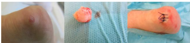
Figure 1: Cutaneous angioleiomyoma on the left heel. (a) Clinical presentation as a firm subcutaneous nodule covered by epidermal callus formation (left). (b) Surgical specimen of a well-circumscribed tumour with a smooth surface (middle). (c) After wound closure (right)

We performed surgery under local anaesthesia to remove the lesion completely and obtain a histopathologically confirmed diagnosis. During surgery, we observed a well circumscribed firm tumour of about 1 cm in diameter with a smooth pseudocapsular surface (Fig. 1b). The tumour was not attached to deeper structures but skin.