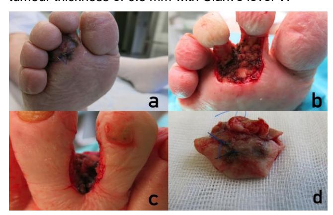
Figure 1: Amelanotic acrolentiginous melanoma involving two interdigital spaces. (a) Clinical presentation; (b) and (c) After first Mohs session; (d) Surgical specimen

removal by delayed Mohs technique (Fig. 1b-d). Histologic examination of the specimen confirmed the diagnosis of ALM, tumour thickness, Clark level. The first Mohs session was successful in removing the tumour but margins were positive for melanoma in situ component. The histologic investigation revealed a tumour thickness of 6.8 mm with Clark's level V.