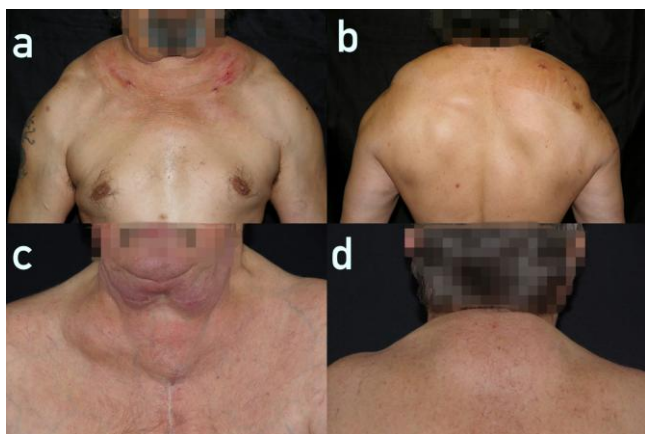
Figure 3: Improvement of Madelung's disease by tumescent liposuction (Case 3). Before treatment (a, b) and after liposuction (c, d)

MD must be differentiated from Cushing syndrome and syndromic lipomatosis types of the head and neck region such as Familial Multiple Lipomatosis (FML), Encephalo-Cranio-Cutaneous Lipomatosis (ECCL), Congenital Infiltrating Lipomatosis of the Face (CIL-F), and Nasopalpebral Lipoma-Coloboma Syndrome (NLCS) [8, 9].