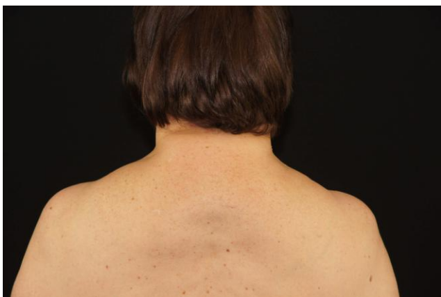
Figure 4: Moderate growth of subcutaneous adipose tissue with some telangiectasias (Case 4)