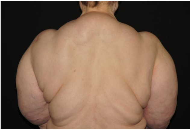
Figure 8: Massive disfigurement of the pseudo-athletic type of Madelung's disease (Case 8)