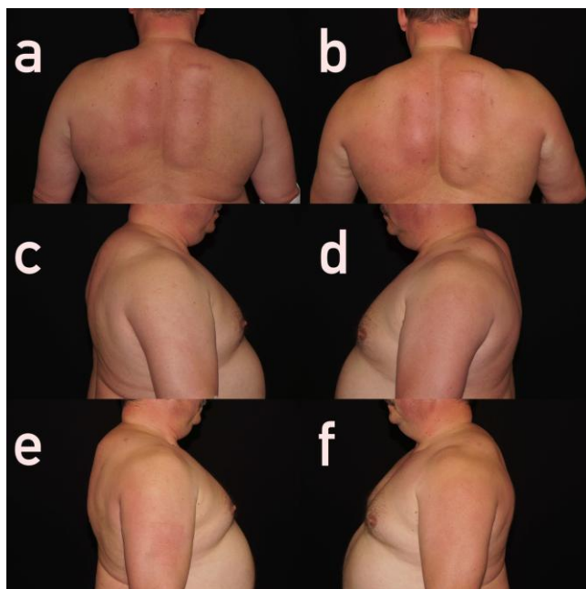
Figure 7: Fibrotic Madelung's disease with dynamic growth (a and b), relapse after lipectomy; Stepwise improvement by tumescant liposuction from (c, d) to (e, f)

Treatment and Course: He had a lipectomy in a plastic surgical department six years ago that relapsed. We performed two sessions of tumescant liposuction. The total amount of lipoaspiration was 600 ml. The procedures were well tolerated. After the second liposuction, he developed a symptomatic methemoglobinemia that was treated by intravenous injection of toluidine blue solution.