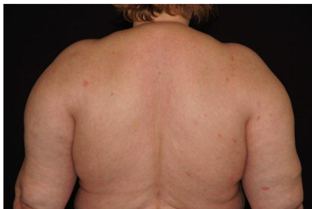
Figure 6: Pseudo-athletic appearance in Madelung's disease (Case 6)

On examination, there were massive disfiguring adipose tissue deposits on neck, shoulders, arms and gynecomastia. The largest neck circumference was 50 cm.