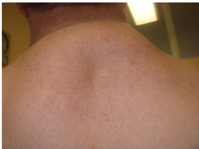
Figure 2: Moderate growth of adipose tissue of the neck in Madelung's disease with development of multiple telangiectasias (Case 2)

MD patients show multiple comorbidities, such as hepatic disease (60%), metabolic syndrome (40%), chronic obstructive pulmonary disease (COPD; 23%), hypothyroidism (10%), malignant tumors of the upper airways (rarely), and chronic alcohol consumption (> 95%) [2].