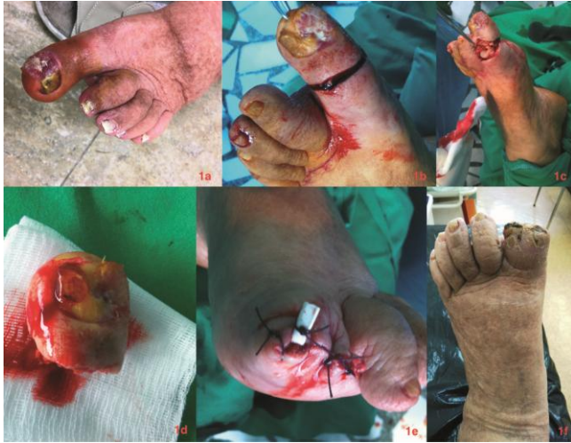
Figure 1: Clinical presentation: 1a - Chronic persistent ulceration in the left toe; 1b - Intraoperative findings. Skin incision; 1c - Disarticulation of the interphalangeal joint; 1d - The resected phalanx; 1e - Disarticulation completed - single layer suture and drainage; 1f - Clinical findings on the 16 th postoperative day

by the patient, nor was there a history of viral warts. Arterial hypertension and arrhythmia were reported as comorbidities, well controlled with medications (Enalapril 10 mg 1-0-0, metoprolol 12.5 mg 1-0-0, and torasemid 20 mg 0-1-1). The initial symptoms were treated as an ordinary fungal infection with systemic administration of itraconazole and topical application of 40% urea cream, without significant effectiveness during the following year. Because of the lack of improvement, the nail bed was biopsied, and the diagnosis of SSCC was confirmed by histological examination (Figures 2a to d).