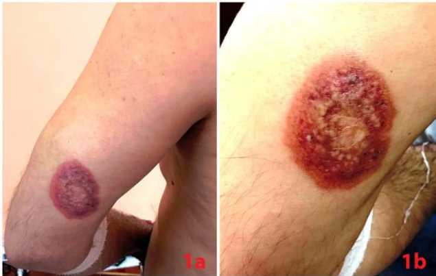
Figure 1: Clinical aspect. a: Large erythematous plaque with dotted whitish areas on the surface; b: Close-up view

granuloma that included rare giant cells, with discrete Palisades and piecemeal collagen degeneration, but without mucin deposition or frank necrobiosis of collagen. The clinical and histologic findings were supportive for interstitial granulomatous dermatitis.