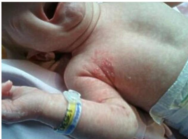
Figure 1: Blisters and bullae, on inflammatory ground, localised on the trunk, in a linear arrangement which follows the lines of Blaschko

The entire pregnancy had taken place regularly, without any complication.