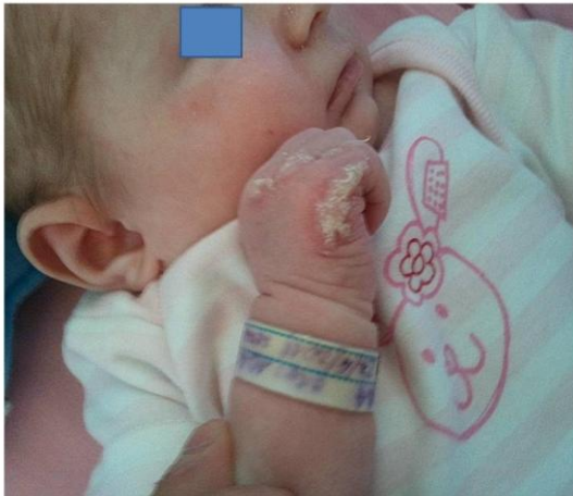
Figure 4: Warty lesions on the right hand

Because of the spontaneous improvement and resolution of skin lesions, we prescribed only an antibiotic therapy to avoid secondary infections of the lesions.