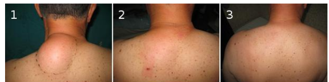
Figure 2: Preoperative (1), early postoperative (2) and late postoperative findings (3) at the same patient with lipoma on the upper dorsal region treated with liposuction

Photo documentation of two cases is shown in Figure 1 and 2.