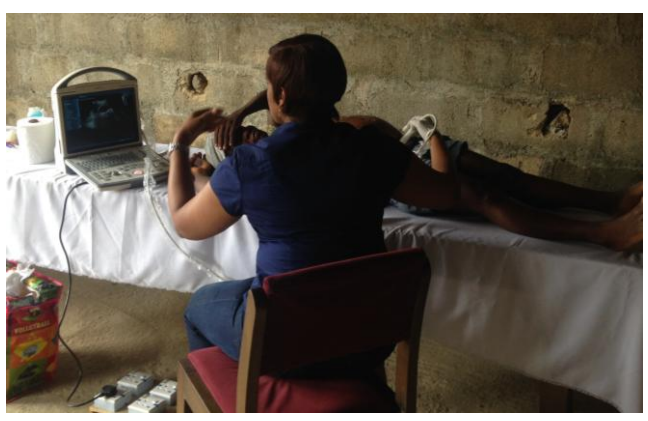
Figure 2: Pelvic-Ultrasound scanning during the medical outreach

A typical sonographic scan being carried out is shown in Figure 2.