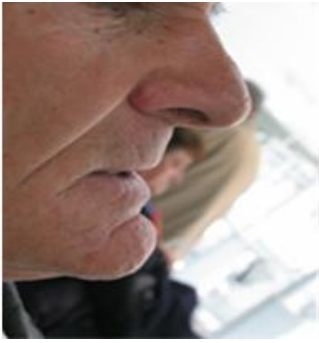
Figure 2: Profile view of the patient with dOVD (left) and the same patient with corrected dOVD (right)

Every patient got OS for correction of OVD. Increasing of previously dOVD was done according to functional and esthetic criteria. The mean value of increased OVD is 8.5 mm, and this means that for this amount is decreased the difference between rest position and OVD. The period of adaptation to corrected vertical relation was for 3.5 months (from 2.5 to 5 months), and during this time all of our patients had to use OS during the night according to previously determined the regime of uses. A daily use of the OS was in the period from 3 to 4 hours. During this period three visits were done - the first visit after the first week, the second visit after three weeks of using the OS and finally, the third visit was done after two months. Afte that, the reduction of symptoms compared with the very beginning of the treatment with OS was evaluated.