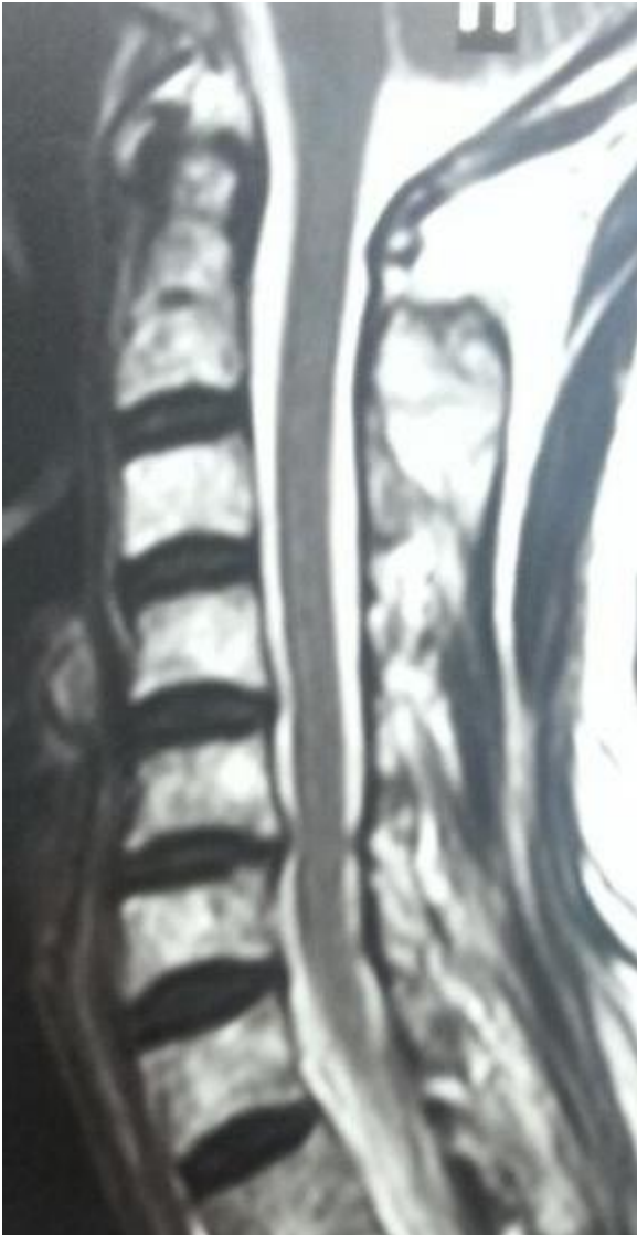
Figure 1: Magnetic Resonance Imaging T2 sequence of cervical spine, showed compression of spinal cord at C 5-6 level

the wall of the disc, filled the spinal canal and compress the spinal cord (Fig. 1).